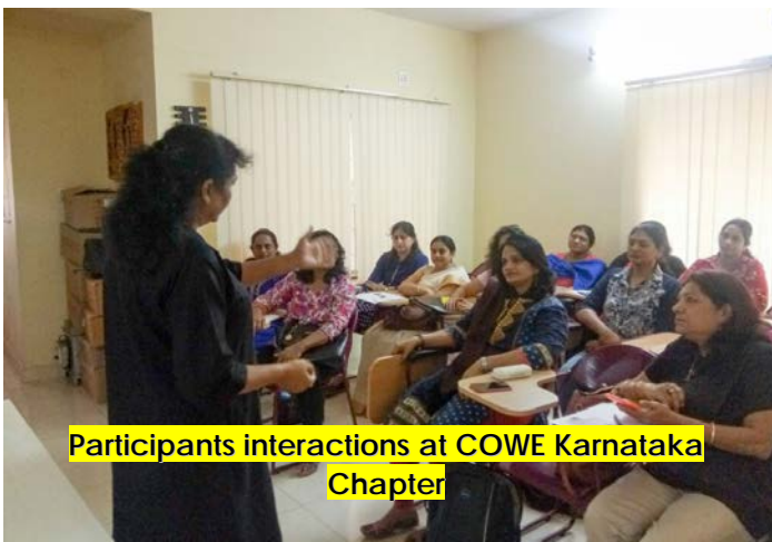
Participants interactions at COWE Karnataka Chapter