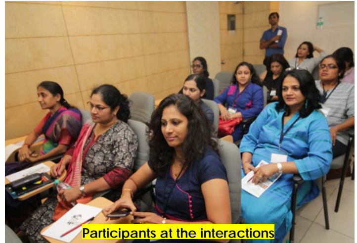
Participants at the interactions