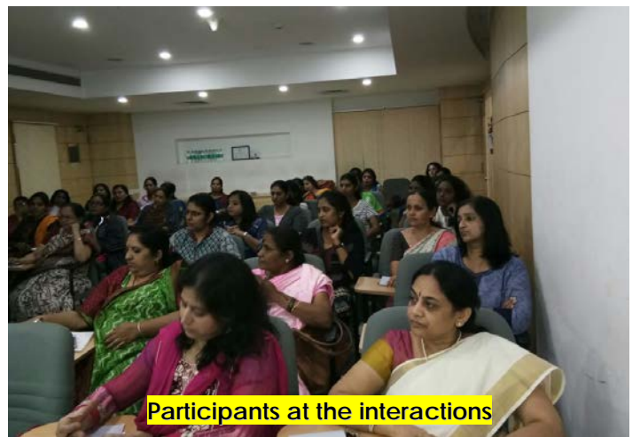
Participants at the interactions