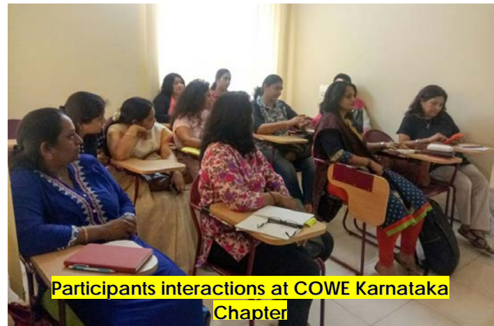
Participants interactions at COWE Karnataka Chapter