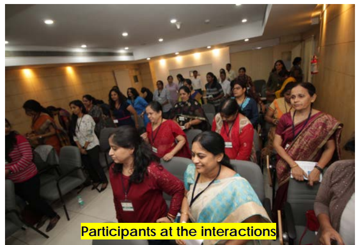
Participants at the interactions