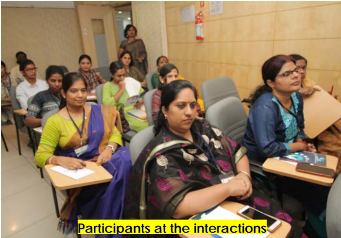
Participants at the interactions